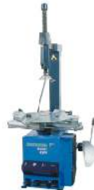
Hofmann Tyre Changer